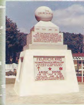
Arise, Shine Marker —Identifies the location where the work of restoration continued in the 20th century, and where the foundation of the church (apostles and prophets) is illustrated.