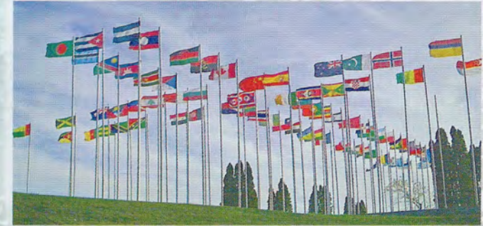
All Nations Cross —150-foot cross atop All Nations Mtn. Flags represent many nations that have been reached with the message of Christ (flags displayed seasonally).