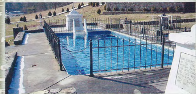
Great Commission —"Go therefore and make disciples of all nations, baptizing them in the name of the Father and of the Son and of the Holy Spirit" (Mt. 28:19 NASB).

A Bible Park where God's Word is displayed amid God's Creation!