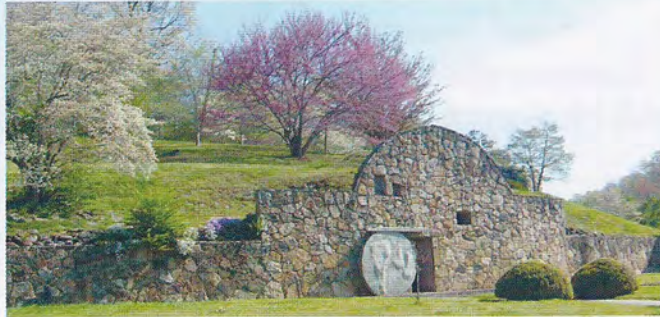
The Tomb —Christ's burial was in a borrowed tomb, similar in size and shape to this one. He did not stay in the tomb, for on the third day, He arose!