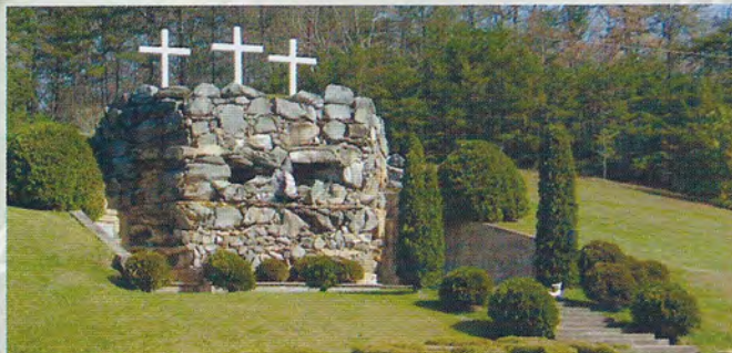
Golgotha Replica —Here, Jesus offered Himself as a sacrifice so that our sins might be forgiven.